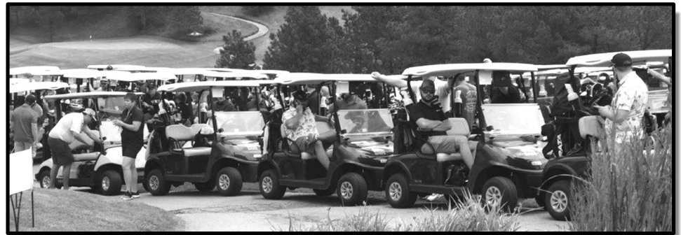
The golfers get ready to take off.

Black Hills Community Bank put on a 5K to help raise money for their annual Diaper Drive which benefits the babies of Cornerstone!